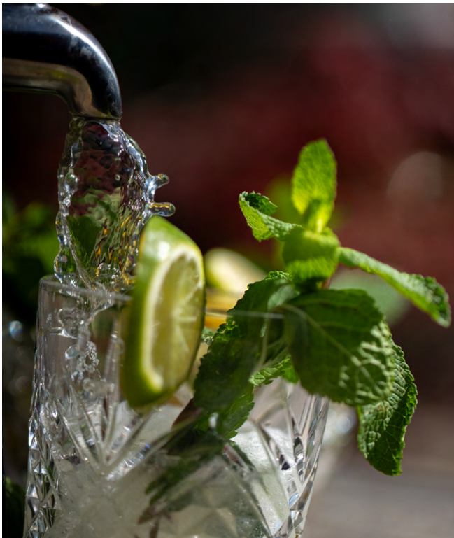
Our homemade OSD lemonade