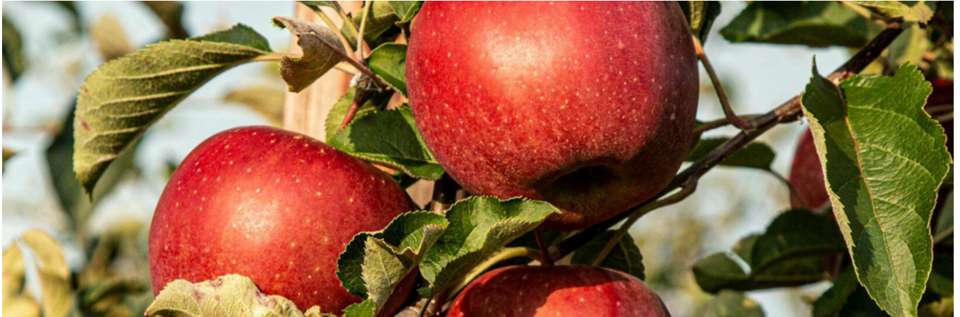
Fresh from our garden